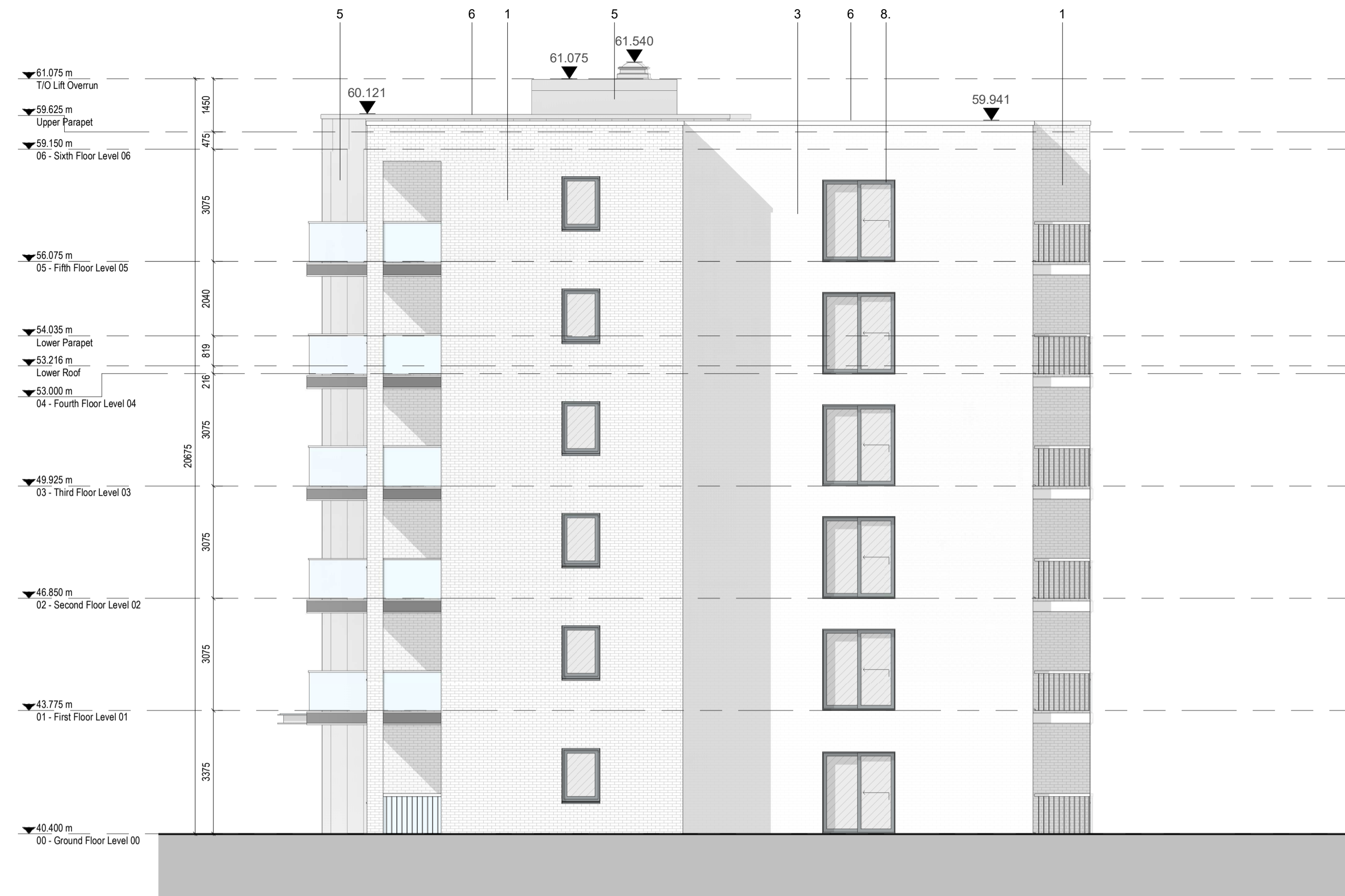
1 GA - North Elevation 1 : 100