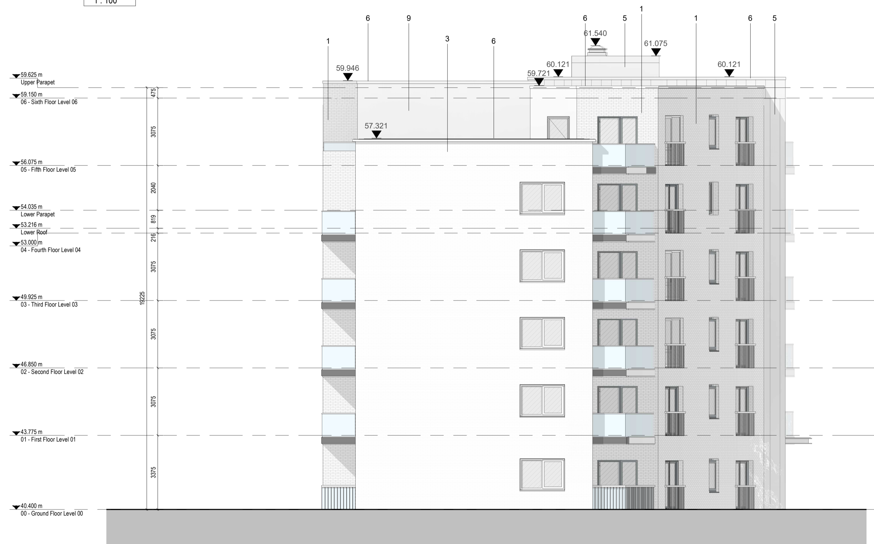
2 GA - South Elevation 1 : 100